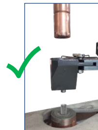
Automatically Fed Stud

Note: The SXZR weld body is not recommended for manually fed weld studs.