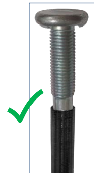
Stud and Stud Weld Pin