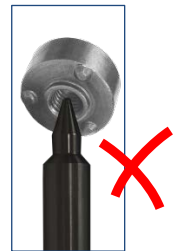
Nut and Nut Weld Pin