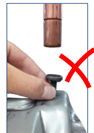
Manually Fed Stud